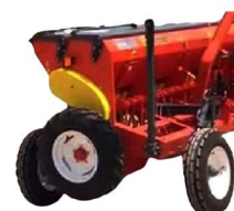
Road Transport System