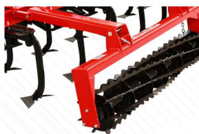
Single Rotary Roller