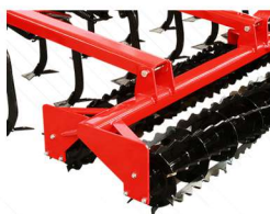
Double Rotary Roller