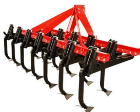
Vertical Spring Type