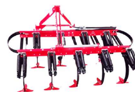
Hydraulic Shift Garden Type Spring Cultivator (5-7-9 legs)