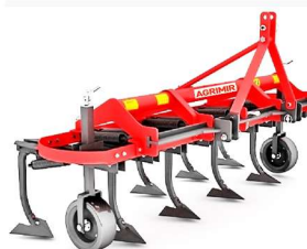
Garden Type Spring Cultivator (5-7-9 legs)