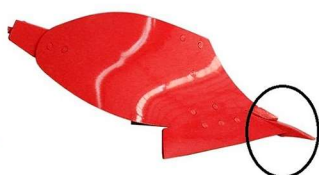
Wedge Blade Type