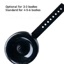
Optional for 2-3 bodies Standard for 4-5-6 bodies