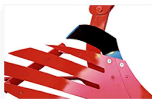
Grid Blade Type